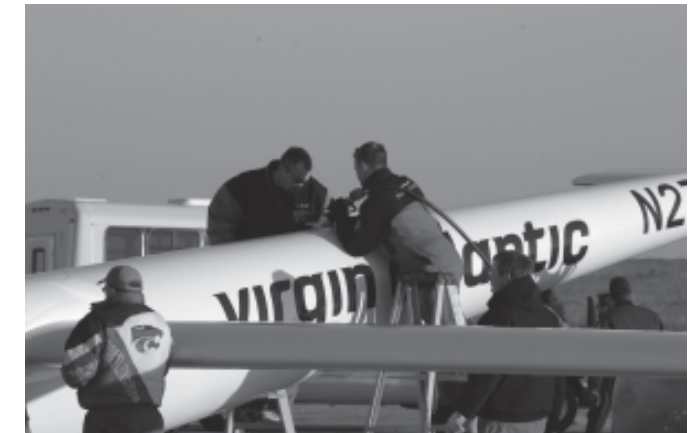
AVIATION MAINTENANCE STUDENTS FUEL THE GLOBALFLYER AIRCRAFT IN PREPARATION FOR FOSSETT'S FLIGHT.

Meanwhile, four professional pilot students were selected to support flight planning and work in Mission Control, which was housed in the College Center on campus. These four students worked directly with Steve Fossett to plan the flight, taking into